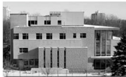
North Campus Building at The University of Western Ontario Home of the Faculty of Information & Media Studies

Click ' Current Issue ' to read the latest publication. Detailed information about the journal, including its editorial board and its mission, as well as an archive of past issues, is available via the top menu bar.